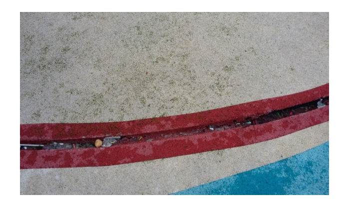
Appendix I – Photos of current site condition